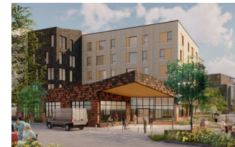
J.J. Carroll House Brighton, MA