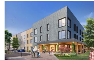
Leland House Waltham, MA