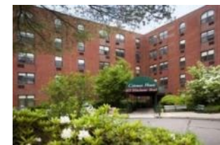
Coleman House Newton, MA