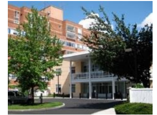
Kurlat House Brighton, MA