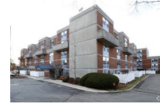
Leventhal House Brighton, MA