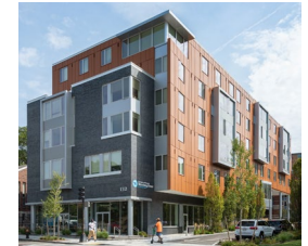
Weinberg House Brighton, MA