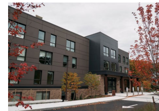
Golda Meir House Newton, MA