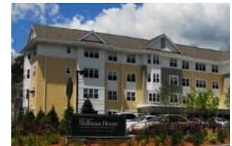
Shillman House Framingham, MA