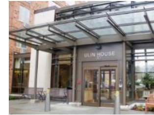
Ulin House Brighton, MA