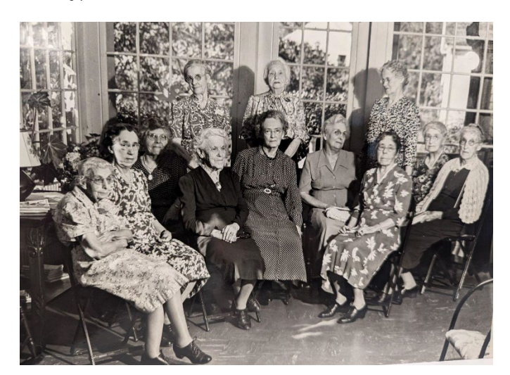
Leland Home residents, summer of 1936.