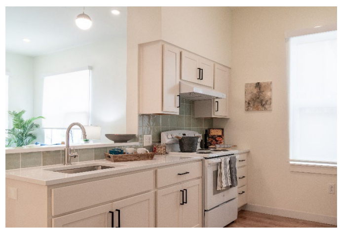
All apartments are light filled and beautifully appointed, with fully functioning kitchens to maintain independence.