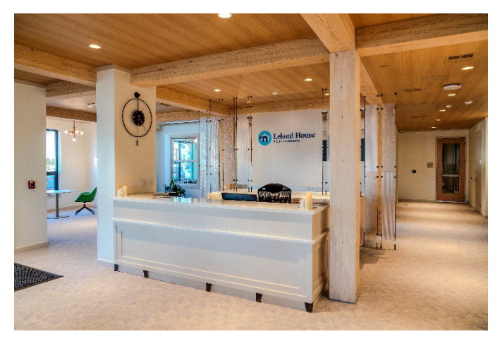
Leland House's welcoming front desk.

Residents benefit from the wide variety of programs and services typical of every 2Life community. Leland House offers on-site maintenance staff, care coordination services, and 24-hour emergency staff response. In addition, residents can participate in lifelong learning, wellness, cultural, and social programs.