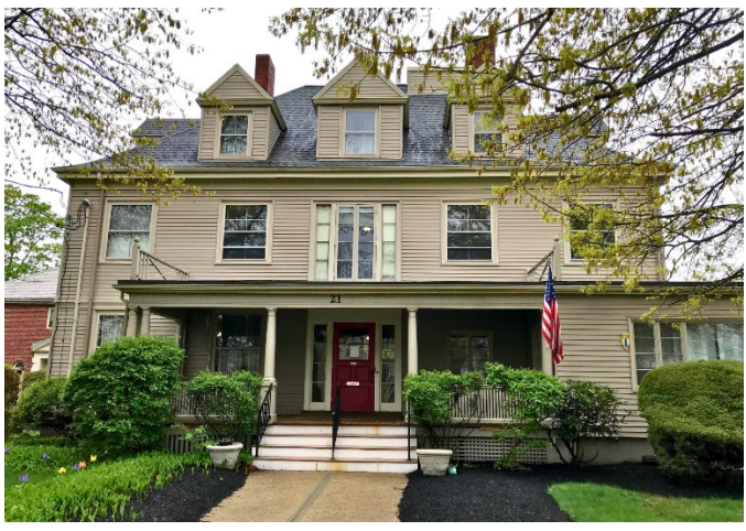
The original Leland Home.